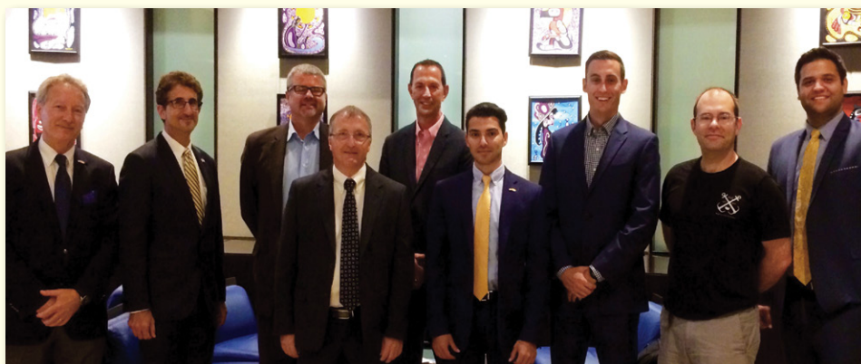
Maine delegation on the Trade Mission to Toronto last year.

Combined US imports and exports with Canada and Mexico grew from $291 billion in 1993 to $1.1 trillion in 2016, a rate of 267 percent. While it's never accurate to credit increased trade to one factor like NAFTA (US exports increased 242 percent with non-NAFTA countries during the same time period), there is little dispute NAFTA had a large effect on increased trade between the three nations.